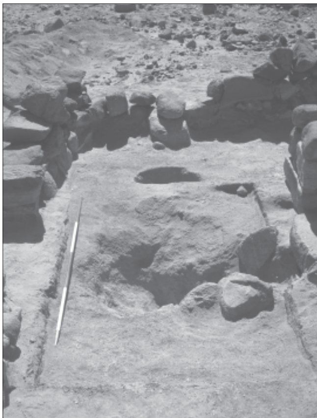
Plate 2. Pits in the enclosure to the east of the offering chapel, looking south.

Also dating to this phase, a number of pits were dug to the east of the location later to be occupied by the offering chapel (Plate 2). Two of these were on the main axis of the monument and one partly cut the other. They were filled with sand and gravel. A little to the south was another circular pit approximately 500mm in depth with a similar fill; right at the bottom was a collection of 12 udjat eyes, in fine grained ferruginous sandstone, amazonite(?) and perhaps glazed composition, three of the latter being gilded (Colour plate I). Exactly under the south-east corner of the offering chapel was a shallow bowl-shaped pit in which was a thick layer of charcoal and many fire-reddened pieces of gneiss (Plate 3).