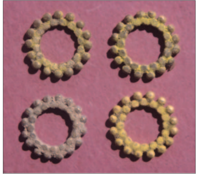
Colour plate II. Amri to Kirbekan Survey. Site 4-F-71. Metal rings coated in a yellow powder.