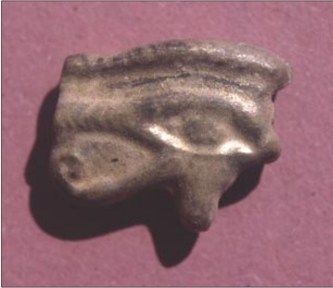
Colour plate I. Amri to Kirbekan Survey. Site 4-F-71. Gilded udjat eye from a pit within the enclosure wall to the east of the offering chapel of the pyramid.