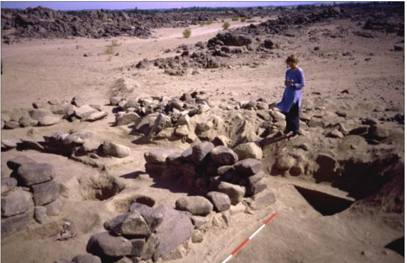
Colour plate III. Amri to Kirbekan Survey. Site 4-F-71. The eastern end of the enclosure with quarry pits outside and pits of uncertain function within.